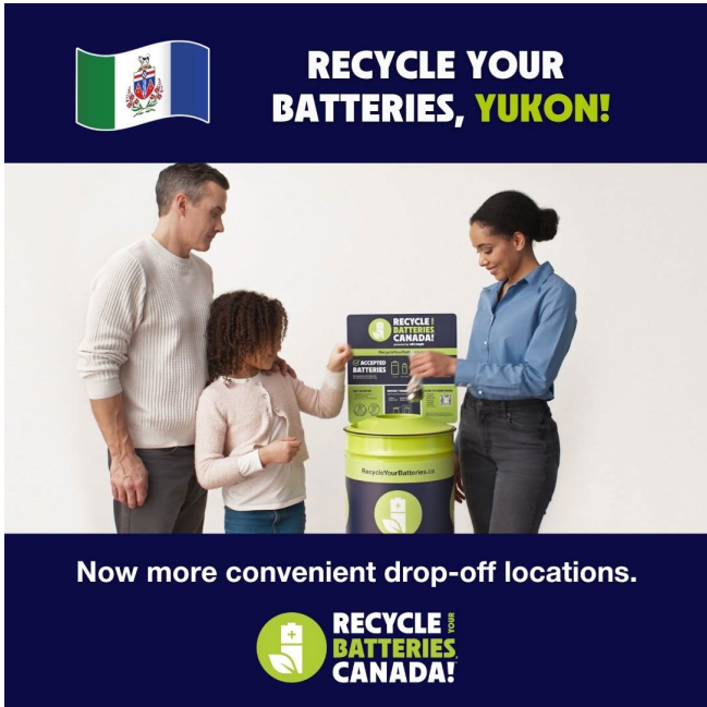
Paid Social Media Posts Directed Consumers to visit the blog and FAQ