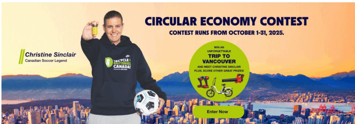
Christine Sinclair appeared National TV and digital commercials promoting the Circular Economy contest